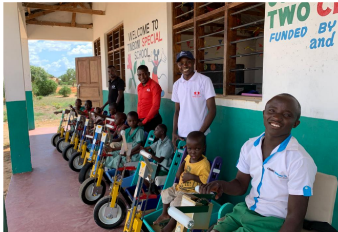
PFC partnership with Timboni Special School