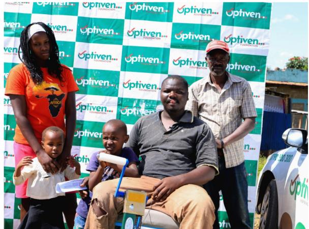
PFC partnership with Optiven Foundation