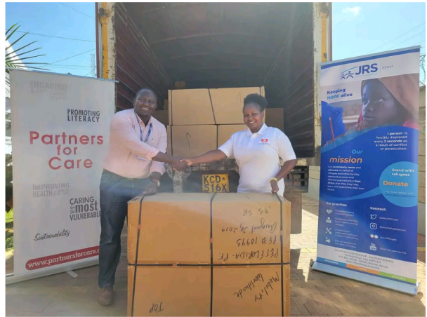
PFC partnership with Jesuit Refugee Services