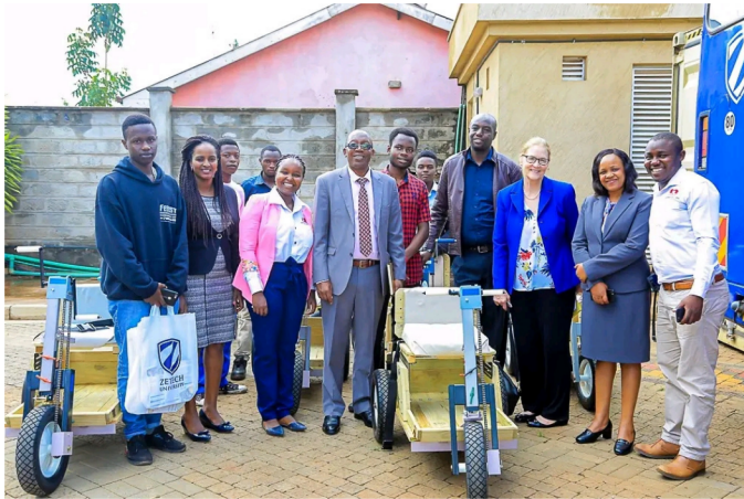
PFC partnership with Zetech University

Partners for Care (PFC) works in partnership to make every Kenyan mobile. We have over 200 partners in Kenya. We have partnered with Former First Lady Her Excellency Margaret Kenyatta, the Israel Embassy, 41 county governments, 59 Members of Parliament, 54 Women Representatives, clubs like the Lions and Rotary International, religious groups, educational centers, higher learning institutions like Zetech University and Mount Kenya University, humanitarian organizations like Kenya Redcross, community-based organizations, foundations including Safaricom, Optiven, etc, well-wishers and individuals.