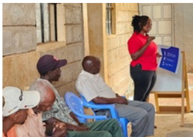
Community health teaching