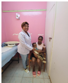
Children getting the measles vaccine

To date ,there have been 1,960 children immunized. These efforts contributed improved child health outcomes and protection against preventable diseases.