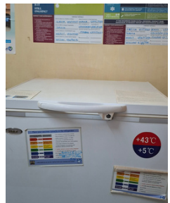
Our WHO approved vaccine freezer