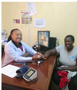
Blood sugar screening