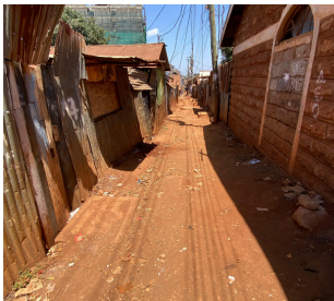
Jua kali slum