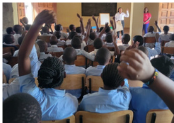
Training in school