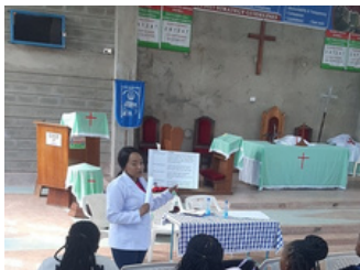
Training in the church