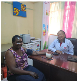
Blood pressure screening