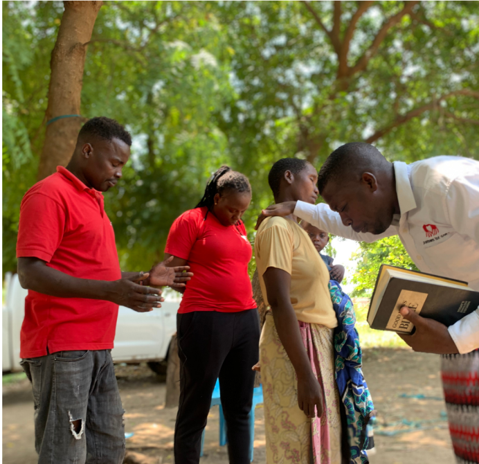
PFC staff Kilifi County during door-to-door outreach

Partners for Care (PFC) seeks to spread the gospel in the unreached regions of Marsabit and Kilifi Counties. The PFC staff use a dynamic strategy to spread the word that adapts to each community's specific needs since the staff are locals in these regions. This report explores the innovative ways the PFC staff manage to engage people in evangelism, the frequency of their outreach and the diverse strategies used to preach the gospel.