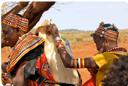
First WaterSafe backpack to be placed on a beneficiary in Marsabit County