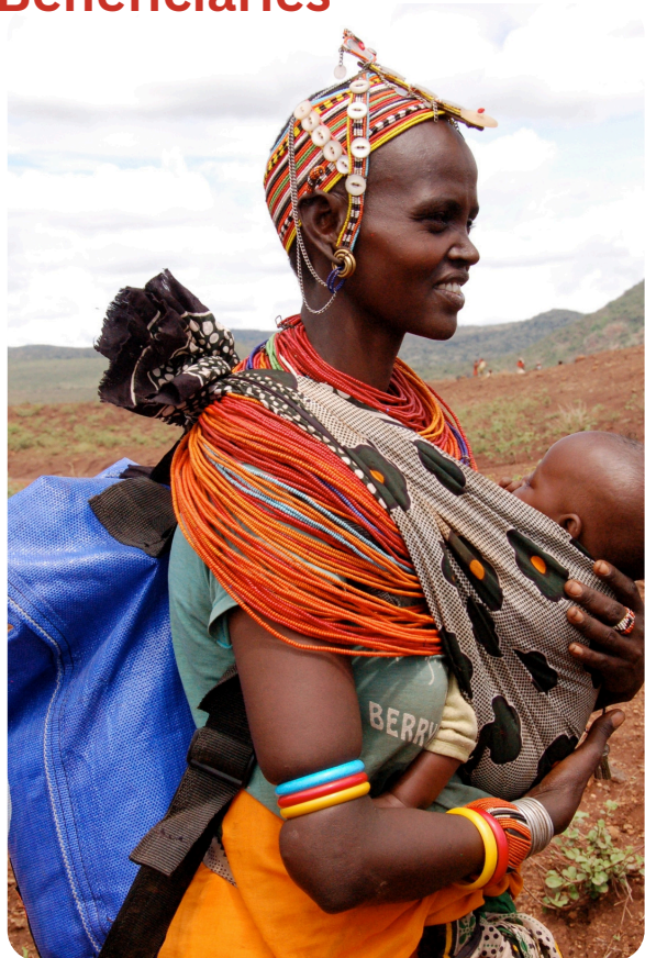
One of the first beneficiaries of the WaterSafe in Marsabit