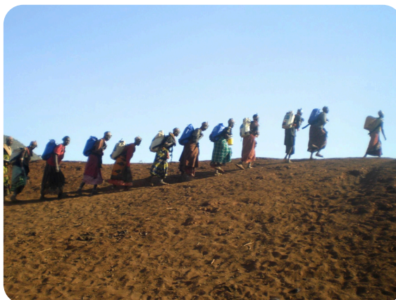
The initial distribution of WaterSafe backpacks in Marsabit County, Kenya